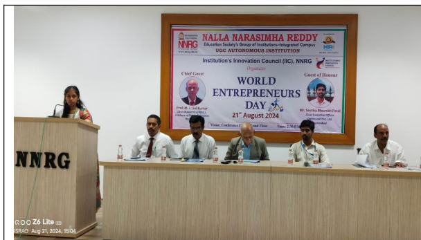
Dignitaries on to the dias

World Entrepreneurs Day is celebrated on August 21 every year. On this day, individuals from all around the Nation /world get together to discuss ideas, tell stories, and support one another to pursue their business dreams. The first time, World Entrepreneurs Day was observed in 2010