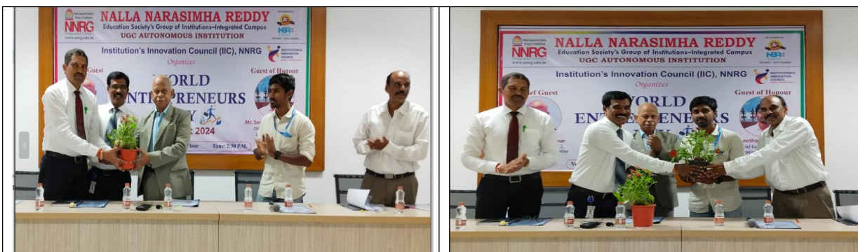
Respecting the Chief Guest and Guest of Honour with saplings by the IIC - Convener and Deans of SOP and Dean of SoMS