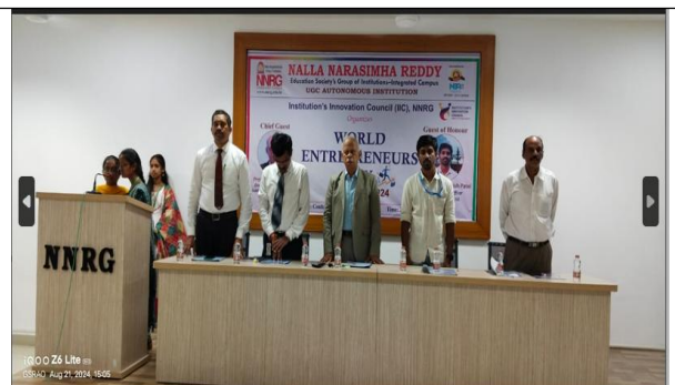
Invocation song by Pharmacy III year students